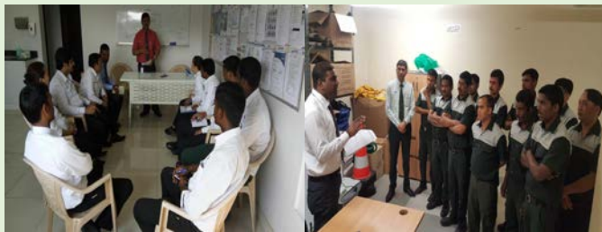
QZS - KHUH

Toolbox Talk Trainings were conducted by Health & Safety officers to various Divisions: Quick Zebra Services, Protect Security Services, Executive FM and One Call discussing topic regarding Control of Substances Hazardous to Health (COSHH).