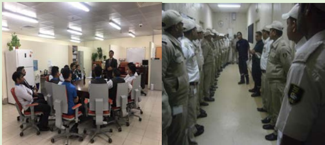
QZS – CCB